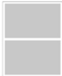
1/2 HORIZONTAL AD: 7 1/2" x 4 3/4"