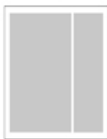
2/3 VERTICAL AD: 4 3/4" x 9 1/2"