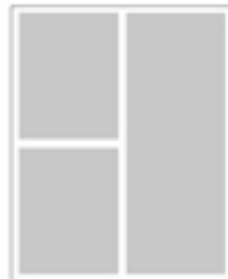
1/4 VERTICAL AD: 3 11/16" x 4 3/4"