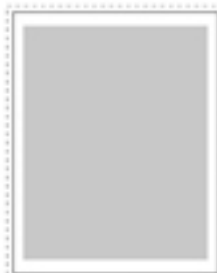
FULL PAGE AD (FLOATING): 7" x 9 1/2"